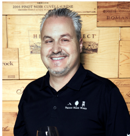
Packing House Wines; LibraryAware