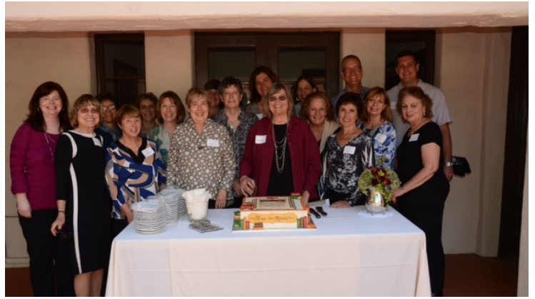
Current and Former FOCL Board Members Celebrate one hundred years of the Claremont Library

During our centennial year, we will be inviting people in Claremont to share their fond memories of a library, any library. It may be the town library where you grew up, the college library where you went to school, the library in the city where you lived for your first job, any library experience you remember as special. Watch for your invitation for sharing these stories.