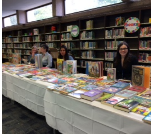
Books waiting to find new homes.